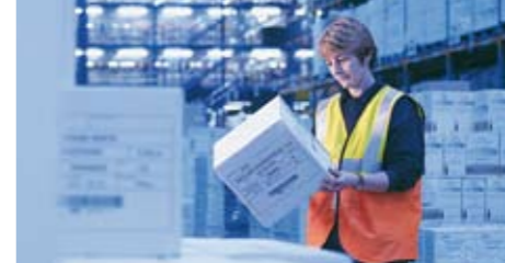
B-SX4 & B-SX5